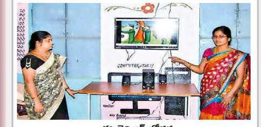
ఈ లెర్నింగ్ బోధన

డిజిటల్, ఈ లెర్నింగ్ పాఠశాలతో ఆకర్షించి విద్యార్థులు భాగస్వాములయ్యేలా కృషి చేస్తున్నారు. పాఠ్యాంశాలతో పాటు జీవన నైపుణ్యాలు, వ్యక్తిత్వ వికాసానికి సంబంధించిన సీడీలను ప్రదర్శిస్తున్నారు. పిల్లలను ఉత్తేజపరిచే అంశాలతో కూడిన డీవీడీలను పాఠశాలలకు అందించారు. స్వజననం వెలికితీసేలా బంకముల్లి, కాగిలాలతో బొమ్మల తయారీని చేయిస్తున్నారు. ఇంప్రజాతలం (మ్యూజిక్) ఎలా చేస్తారో తల్లిరు బిస్తున్నారు. వీటితో పాటు డిజిటల్ తరగతులను ఉపాధ్యాయుడికి ఉపాధ్యాయుడి ద్వారా పిల్లలకు బోధించటం, విద్యార్థుల విద్యార్థులకు పాఠ్యాంశాలను వివరించటం వంటివి పోషిస్తున్నారు.