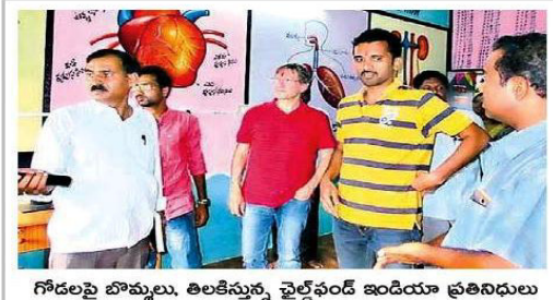
గోడలపై బొమ్మలు, తిలకిస్తున్న ఛైల్డ్ ఫండ్ ఇండియా ప్రతినిధులు

ఒక్కో పాఠశాలకు ఒక్కో టెలివిజన్, కంప్యూటర్, ఇన్స్టర్, బ్యాటరీలు, బల్బులు, కుర్చీలతో పాటు ఇంటర్నెట్ సదుపాయం, వీరువా, టోడనకు అవసరమైన 400 వస్తుకాలు సమకూర్చారు. వీటితో పాటు విద్యార్థుల్లో ఆసక్తిని పెంచి అవగాహన పొందేలా గోడలపై రాతలు, బొమ్మలు గీయించారు. డిజిటల్ తరగతుల బోధనకు ప్రజాసేవాసమాజ్ సంస్థ ద్వారా విద్యార్థులందరినీ ఏర్పాటు చేశారు. వలంబీరు ఈ లెర్నింగ్ తరగతులను బోధించటంతో పాటు డిజిటల్ పరికరాల నిర్వహణ బాధ్యతలను చూసుకుంటారు. లోపాలను సవరించుకుని సక్రమంగా తరగతులను కొనసాగించేలా చూస్తారు. ఇలా ప్రతి పాఠశాలకు ఒక వలంబీరును సంస్థ ఏర్పాటు చేసింది.