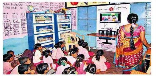
డిజిటల్ తరగతులను వీక్షిస్తున్న విద్యార్థులు